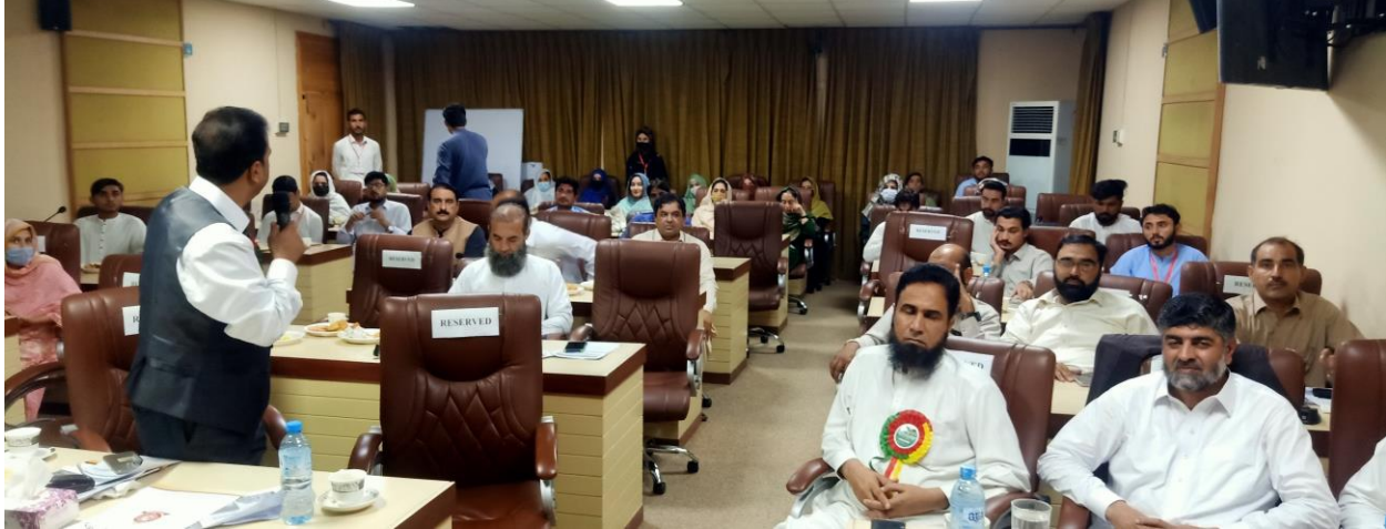
Audience in the inaugural session of the International Conference

Rashakai Special Economic Zone is advancing like three (AIIC, Dhabeji, Bostan) other special economic zones. Rashakai, with 270 acres, was inaugurated in July 2023 with 23 industrial plots already allotted. The Gwadar Port project is the centerpiece of the China–Pakistan strategic partnership and one of their most significant joint development projects in recent years and is key to the future of China–Pakistan's long-standing economic and strategic ties. China has both financed and constructed the deep-sea port at Gwadar in Pakistan's province of Baluchistan on the Arabian Sea. The importance of Gwadar Port cannot be underestimated given its strategic significance, energy security, and economic development. The construction of Gwadar port and related connecting routes with Afghanistan reduce the distance for Pakistan-Central Asia traffic by approximately 500 km.