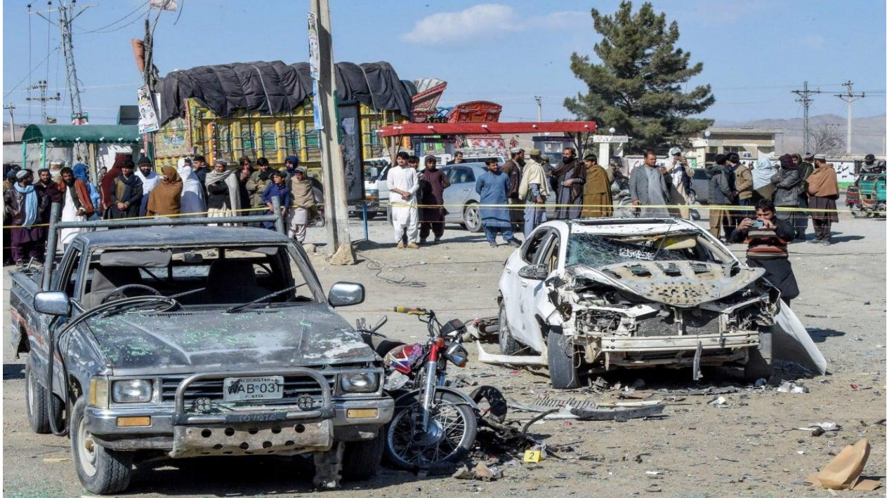
(The site of a bomb blast outside the office of an independent candidate in Pishin district, around 50 kilometers (30 miles) from Quetta on February 7, 2024, the eve of national elections)

All provinces of the country were affected by the menace of terrorism but Balochistan province suffered a lot due to different forms and manifestations of terrorism including suicide bombing and terrorist attacks. Terrorism in Balochistan harmed women, children, the aged, and young people. There is a need of peace advocacy and to spread awareness among young people particularly students and faculty of Balochistan educational institutions about the harmful impact of terrorism on society and prepare them to counter terrorism mentally and physically and save the society from the devastations of this menace. The feedback highlights that the said seminar proved a solid step in strengthening awareness and preparing the youth for united efforts against the scourge of terrorism in Balochistan.