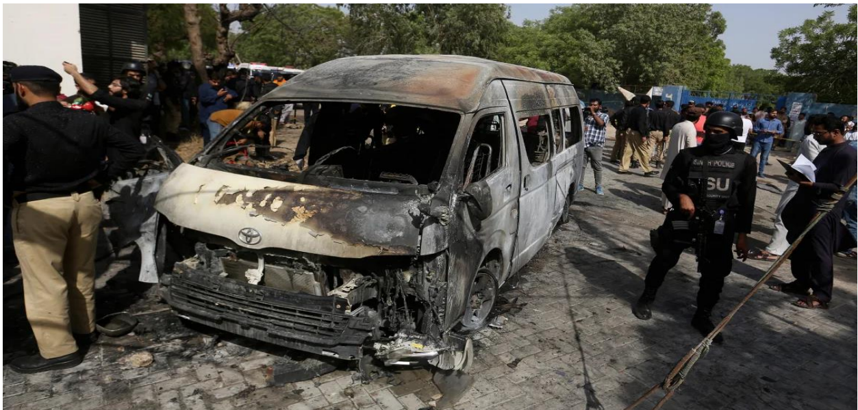
(Police officers and members of the investigation team gather near a passenger van, after a blast at the entrance of the Confucius Institute University of Karachi, April 26, 2022)

Foreign investment in different projects in different parts of the country particularly in Balochistan has paved the way for raising the living standard of common people. For instance, the Gwadar Development project ushered in a new era for local people. Gwadar University was established there, providing higher education at the doorstep of local people. It was implausible without the Gwadar Deep Seaport project. It provided drinking water to local people which was a big issue for the local people. It provided electricity to local people and other facilities too. The new International airport and highways were constructed with Chinese financial support under CPEC.