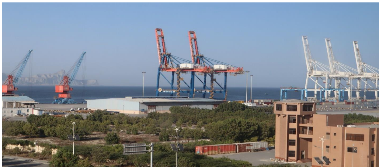
Gwadar Deep Seaport

There are many separatist movements in India including that of Jammu and Kashmir. Indian experts are of the view that since Pakistan is supporting the struggle of the people of Jammu and Kashmir as a quid pro quo India is taking revenge in Balochistan. India is opposing CPEC and its development projects, especially in Balochistan. The regional economic connectivity projects which are in different stages of construction in our region including CASA 1000, TAP, BRI, and CPEC will provide a sigh of relief for people who suffered a lot due to terrorism.