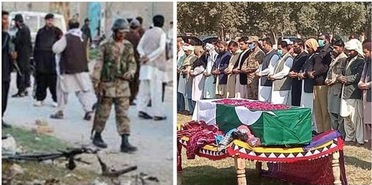
Military officials and residents offer funeral prayers for a soldier who was killed in an attack in the Kech district of Balochistan, in Dera Murad Jamali on January 27, 2022)

Pakistan remains steadfast in its commitment to combatting this peril, demonstrating unwavering solidarity and resolve. The national counter-terrorism initiatives are centered on heightening awareness of the threat, bolstering capabilities for readiness and response, and deepening collaboration with partner institutions and other key stakeholders. A good counter-terrorism policy is practical with essential components that include a roadmap and mechanism for implementation. It is an important question how to reduce appeal to terrorism? One of the devastating effects of regional terrorism is the damage to the tolerant cultural and religious ethos of the country particularly in Balochistan. The people of Pakistan generally and Balochistan particularly are countering terrorism in all its forms and manifestations. Terrorism wreaked havoc in Balochistan, this devastating impact of the terrorist attacks in Balochistan publicly claimed by the terrorist organizations can be viewed through videos, audio, and pictures available on social media.