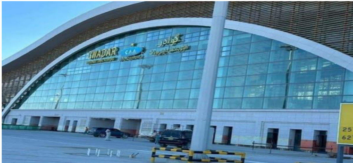
New International Airport in Gwadar

There are many separatist movements in India including that of Jammu and Kashmir. Indian experts are of the view that since Pakistan is supporting the struggle of the people of Jammu and Kashmir as a quid pro quo India is taking revenge in Balochistan. India is opposing CPEC and its development projects, especially in Balochistan. The regional economic connectivity projects which are in different stages of construction in our region including CASA 1000, TAP, BRI, and CPEC will provide a sigh of relief for people who suffered a lot due to terrorism.