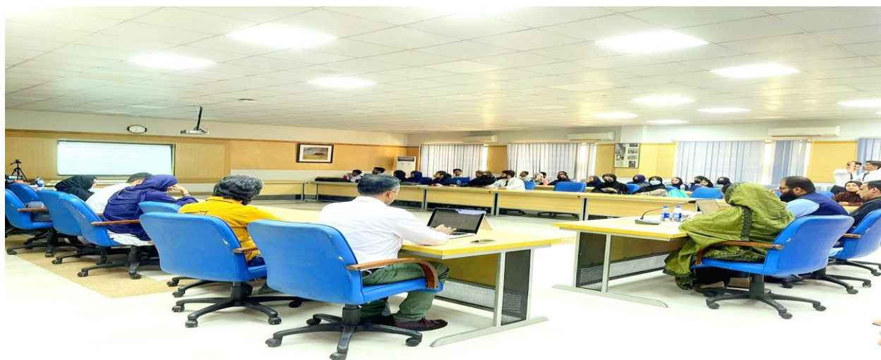
A view of participants

If we develop the right strategies and policies today to meaningfully engage the youth in the province, provide quality education, and secure future socio-economic development, the youth will not be at risk of becoming marginalized, intolerant, vulnerable to social ills, and they will play their due role in local, provincial and national development.